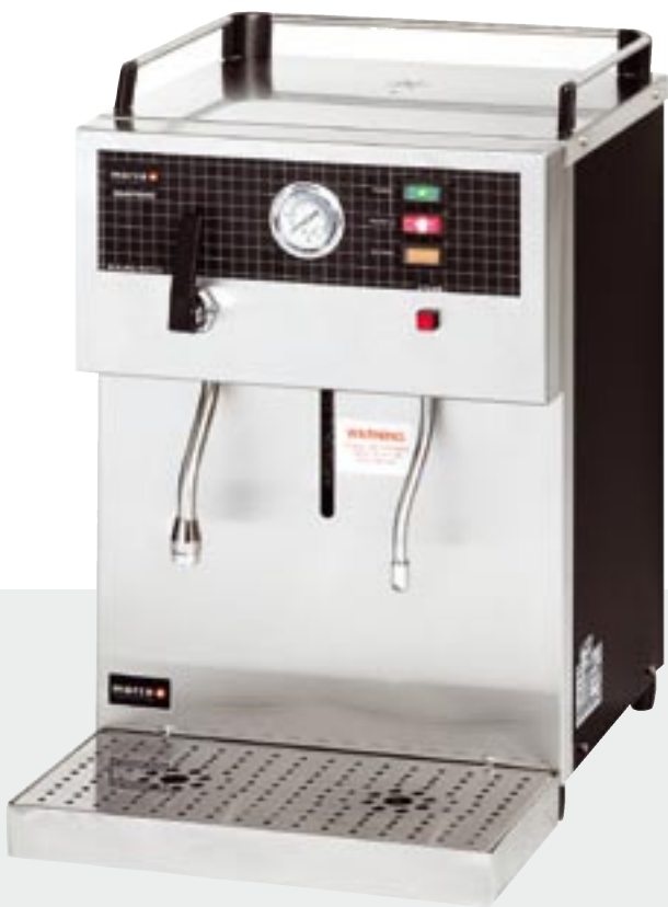
MAJOR 900 COUNTER TOP