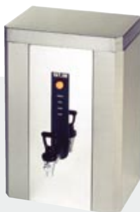
EZT 105 WALL MOUNTED